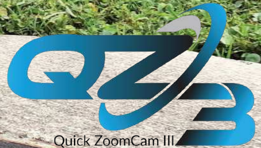
Quick ZoomCam III